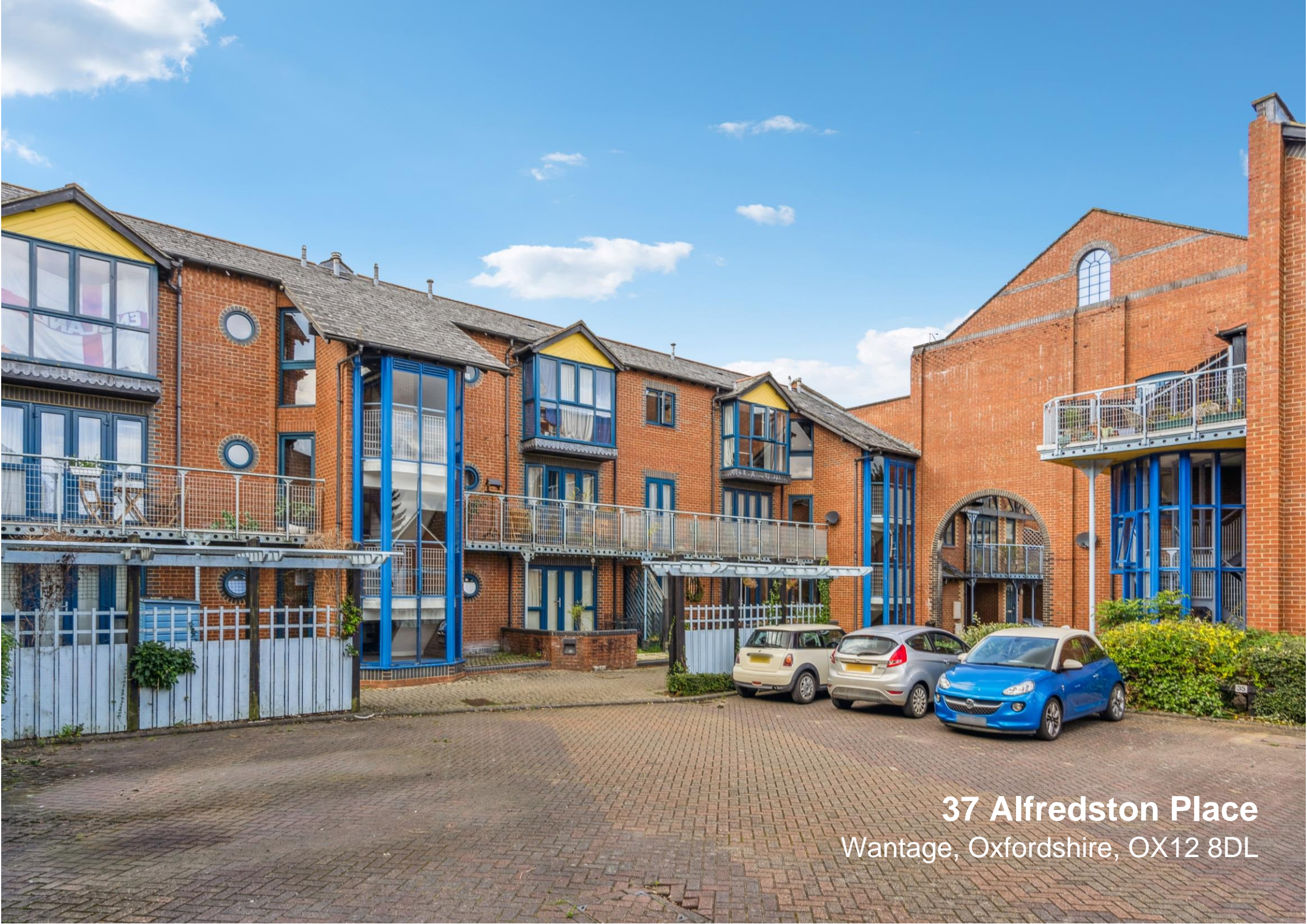
37 Alfredston Place Wantage, Oxfordshire, OX12 8DL